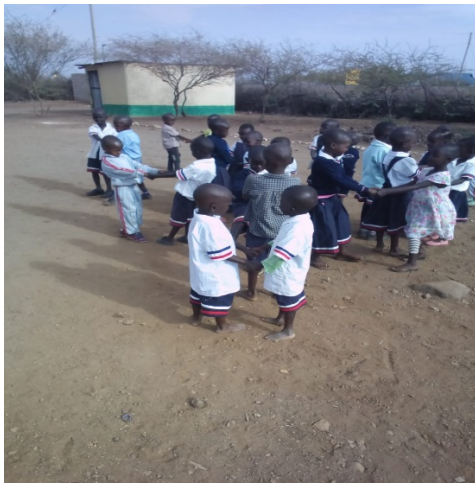
ESEKON AND CLASS MATES