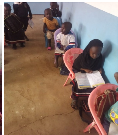
ESEKON IN CLASS